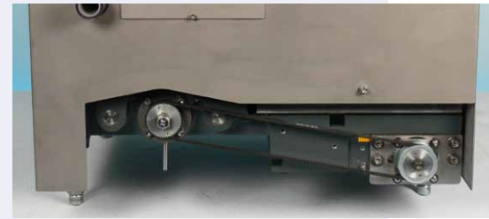
Rear of Secotom-10 for Hot Cell

Equipment size is as small as possible. With a preparation technique based on the MD-system, very little water is used and contaminated waste per sample prepared is minimized. The tray, being the most contaminated part of a grinding/polishing machine, can be disposed of separately.