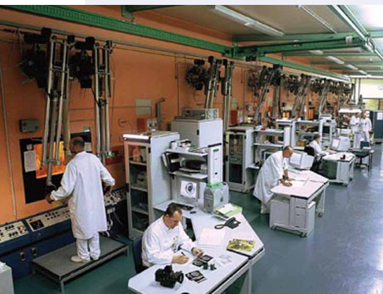
Hot cell laboratory.

The hot cell versions of our equipment can work with Struers standard accessories, consumables and software.