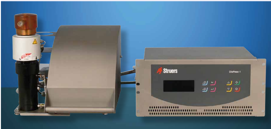
CitoPress-1 for Hot Cell