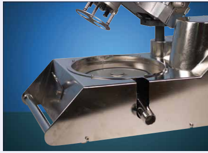
The tray can be detached