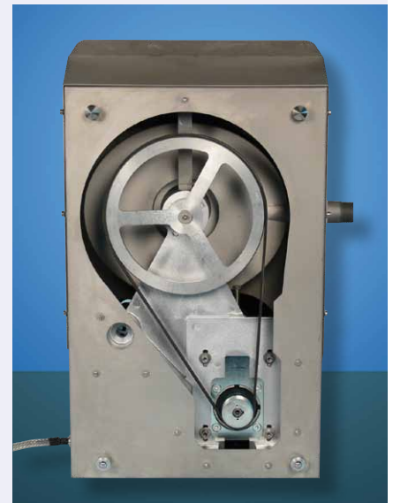
Bottom of TegraPol-15 for Hot Cell