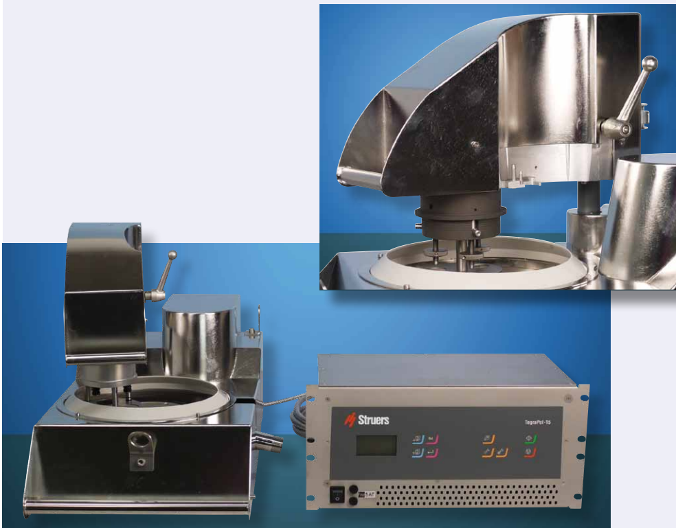
TegraPol-15 and TegraForce-1 for Hot Cell

TegraForce-1 for Hot Cell. Since the radioactivity in the hot cells will eventually attack plastics and electric parts, the use of these materials is cut down to a minimum