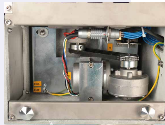
Bottom of Minitom for Hot Cell