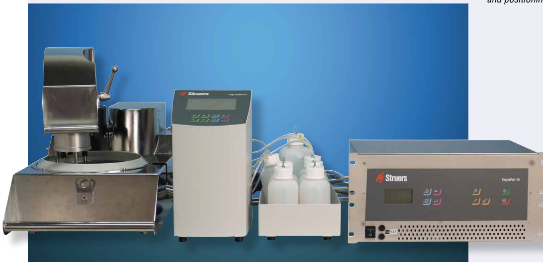
TegraDoser-5. Placed outside the hot cell

The TegraPol is equipped with 3 hooks for easy lifting and positioning of the machine