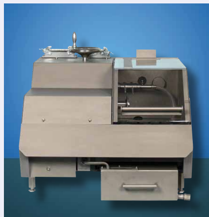
Secotom-10 for Hot Cell

The chassis is made of aluminium and the stainless steel cabinet is mounted with screws which are easy to remove. The cabinet appears with a electropolished surface. The tank for cooling water is in stainless steel with connecting pieces for easy replacement of water. It is placed underneath the cutting chamber. The main motor and feed motor are fastened by screws and equipped with cable connectors, thus it is possible to replace the motors directly in the hot cell using the manipulators. The belt for the feed motor, the pump for recirculation cooling and the standard transparent splash guard of plastic can be replaced in the same way.